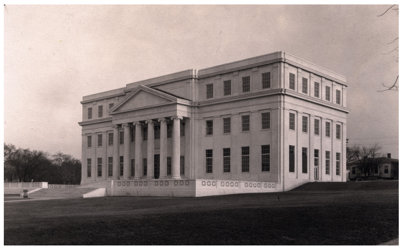
The Alabama World War Memorial Building, home of the Archives, 1940

The agency continued to advance in this mission under the leadership of successive directors. And while some services begun under the auspices of the Archives have become standalone agencies, including the Public Library Service and the Historical Commission, the original commitment to collect, preserve, and share the records of Alabama remained central. In addition to housing permanent state government records, the Archives is the principal repository of Alabama's newspapers and microfilmed county records. It boasts digital collections containing hundreds of thousands of photographs, maps, and documents used by teachers, students, and researchers across the globe. Its historical and genealogical resources are widely used, both in the research room and through numerous online partnerships