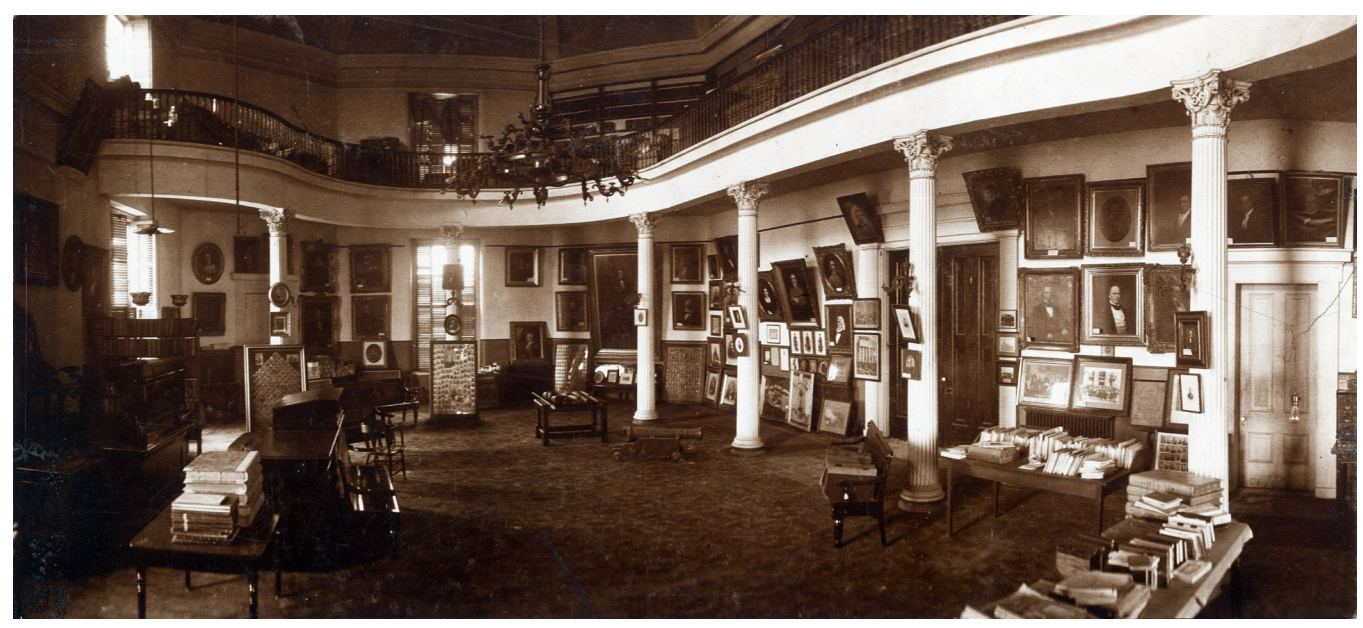
Collections of the Archives on view in the Senate chamber

and the American Historical Association both recognized Owen for his trailblazing work in the professionalization of state history and records preservation.